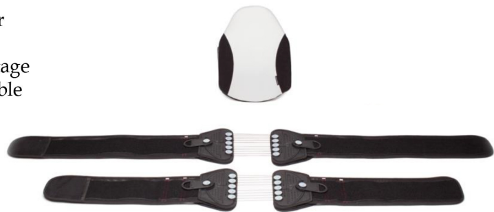
Contoured Padded Posterior Panel provides unsurpassed comfort and support

* Note: Medical advice should be sought on the appropriateness and the condition under which any given spinal bracing system should be utilized.