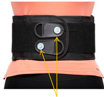
Dual Independent Mechanical Advantage Pulley System